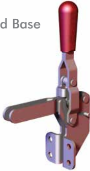
91090 Front Flanged Base Open Bar