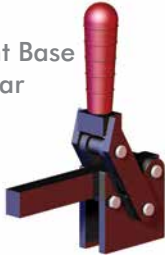
548 Straight Base Solid Bar