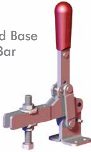
229 Flanged Base Open Bar